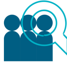
Search and Selection