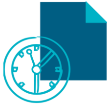
Temporary and Permanent Staffing