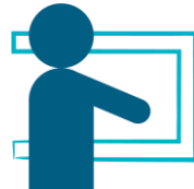
Learning and Development